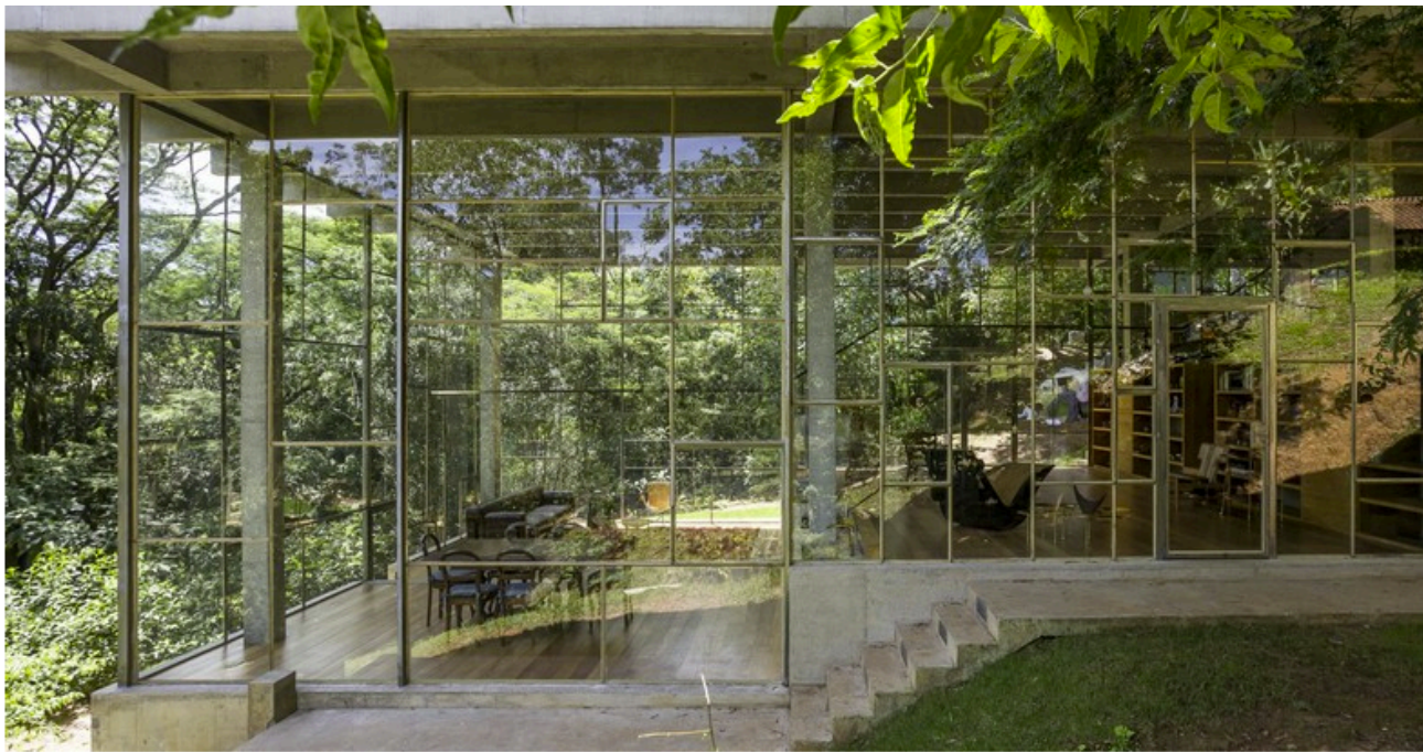
The Dedalo Mimosse International Prize OCCAM - Under 40 was awarded to the Library House designed by the Atelier Branco Arquitetura firm in Sao Paulo, Brazil. An experiment focused on a living space developed on the specific needs of the client, who is a scholar and political activist. The architects designed a unique place where the client can read and think in the dense "Atlantic Malta forest" in Vinhedo.